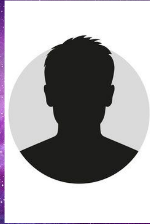
Sparx Lead Developer